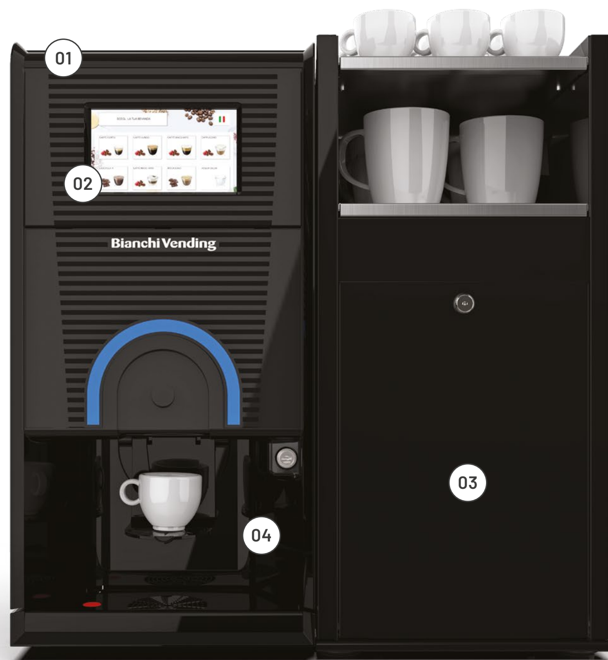
GAIA STYLE RY TOUCH 7" + FRESH MILK MODULE (optional)

Gaia Style Ry renews the pleasure of good company at the office, store or studio: a design element that makes the setting more pleasant, a menu with many possible options providing all the freedom of choice that you could ever want.