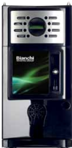
GAIA WITH COIN INTRODUCTION KIT